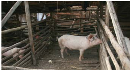
The piggery at Bethany Village

With about 5000 children in our sponsorship program and 177 children in our orphanage program, we spend an enormous amount each year on food alone. In reducing this cost through self-sustained