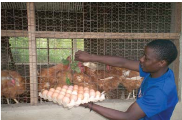
Gathering eggs in Bethany Village

Proper nutrition facilitates normal, healthy growth for children, both physically and mentally. We all know that we can only have a healthy mind from a healthy body.